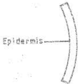
Piece in L_1

The appearance after 20 minutes is as shown.